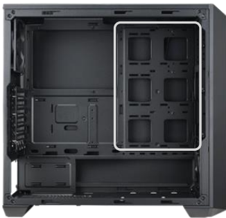
Six routing holes for any system configuration