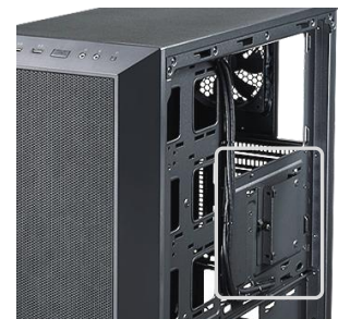
SSD can also be installed behind the motherboard tray