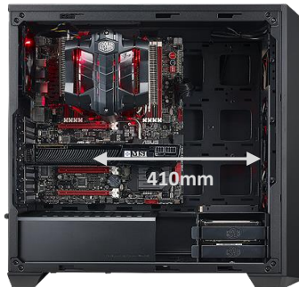
Supports graphic card up to 410mm in length