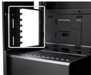
Convenient opening for easy graphic card(s) installation