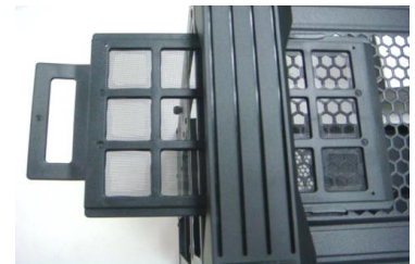
Easy maintenance with dust filters.