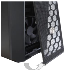
Easy fan installation without removing the full front bezel, but simply by removing the front panel